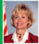
Lt. Governor Becky Skillman